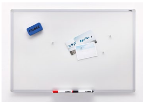
Dahle Megadym cylinder magnet