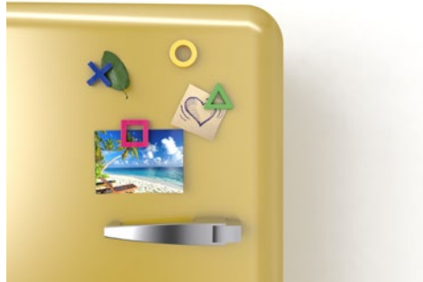
Dahle MEGA Magnet Mini 95554 - small magnets that hold a lot