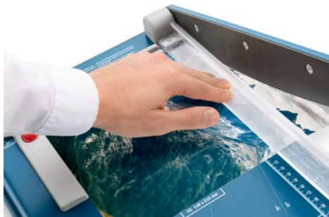
Dahle 534 guillotine - manual clamping with integrated finger guard for securely holding the item being cut