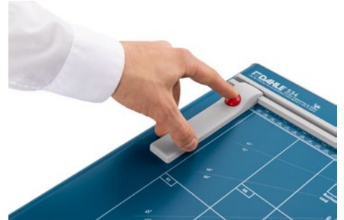
Dahle 534 guillotine - adjustable backstop for quickly finding the right format