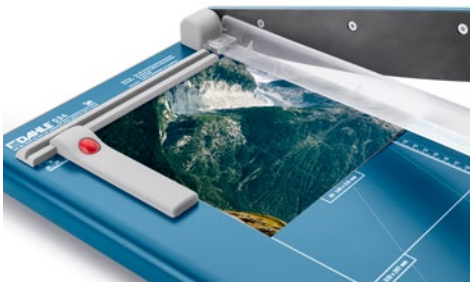
Dahle 534 guillotine - compact entry-level guillotine for hobby use