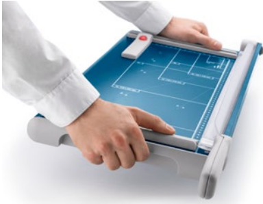
Dahle 534 guillotine - practical recessed grips for safe and easy portability