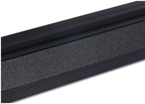
Dahle 10684 cutting ruler - no slipping thanks to wide anti-slip strip underneath