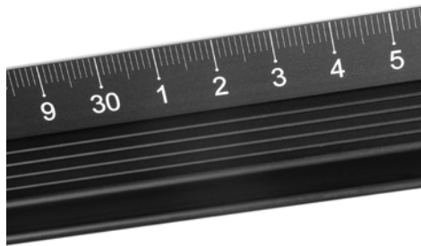
Dahle 10684 cutting ruler - clearly visible centimetre markings for maximum precision cutting