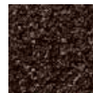
Brown mottled 81.04