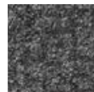
Grey mottled 81.03