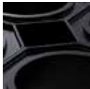
Rubber honeycomb mat: black