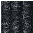
Anthracite no. 200