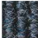
Blue no. 114