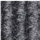
Light grey no. 220