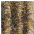
Beige no. 420