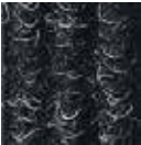
Anthracite no. 200