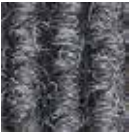
Light grey no. 220