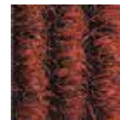
Red no. 305