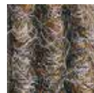
Sand no. 430