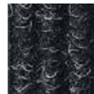
Anthracite no. 200