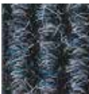
Blue no. 114