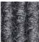
Light grey no. 220