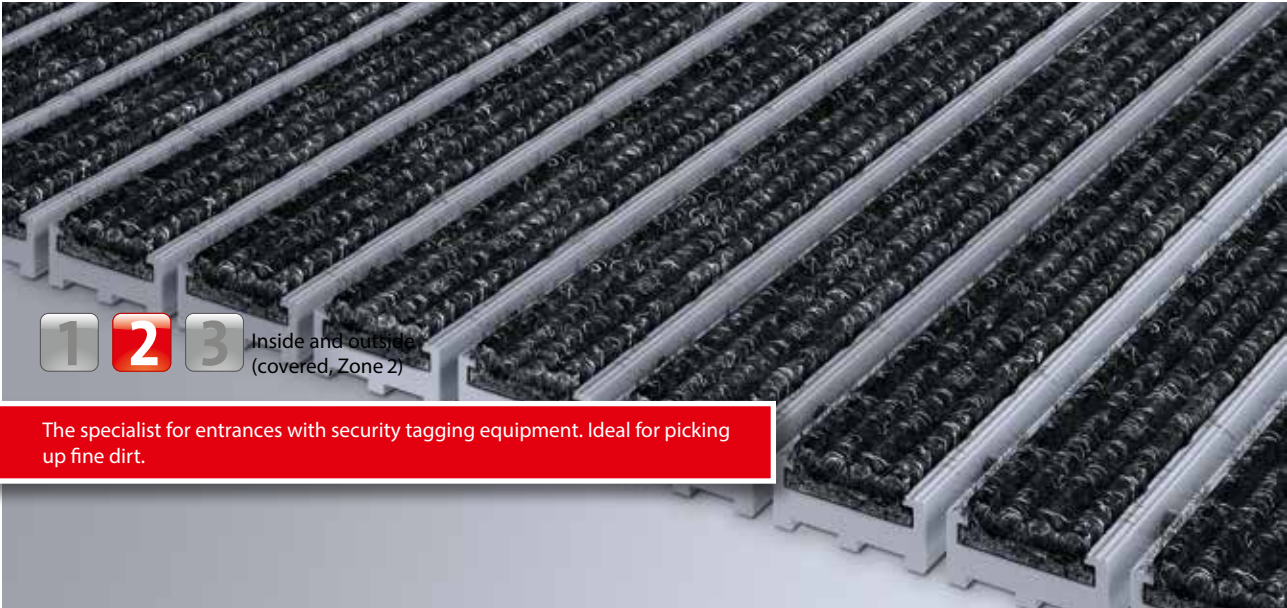
1 2 3 Inside and outside (covered, Zone 2)

The specialist for entrances with security tagging equipment. Ideal for picking up fine dirt.