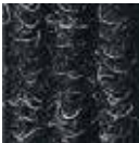
Anthracite no. 200