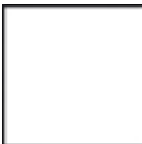
White - similar to RAL 9010